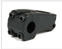
FIT BENNY L STEM - R545