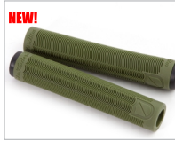
S&M HODER GRIP - R125