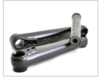
PRIMO PRO CRANKS - R1750