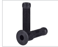
ANIMAL EDWIN - R100