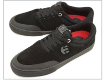
ETNIES MARANA VULC - R595