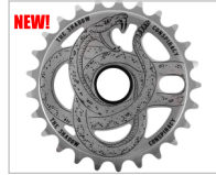
SUBROSA SERPENT - R495