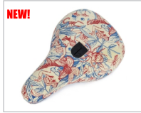
SHADOW PIV SEATS - R595