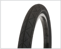
PRIMO WLT TYRE - R325