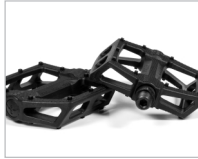
FLY RUBEN PC - R315