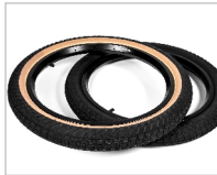
FLY RUBEN TYRE 2.35" - R345