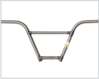
S&M FU BAR 9"/10" - R845