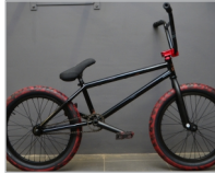
CUSTOM BIKES FROM R9555