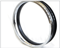
PRIMO RIMS FROM - R755